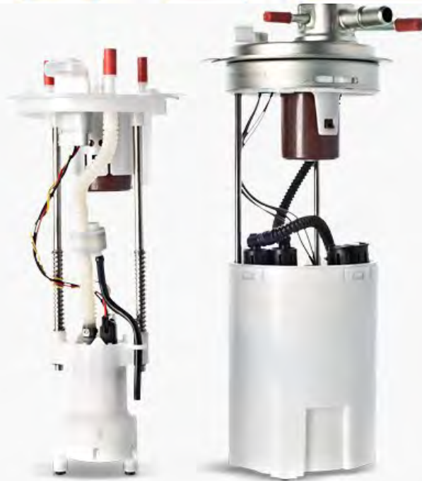
FUEL PUMPS & MODULES