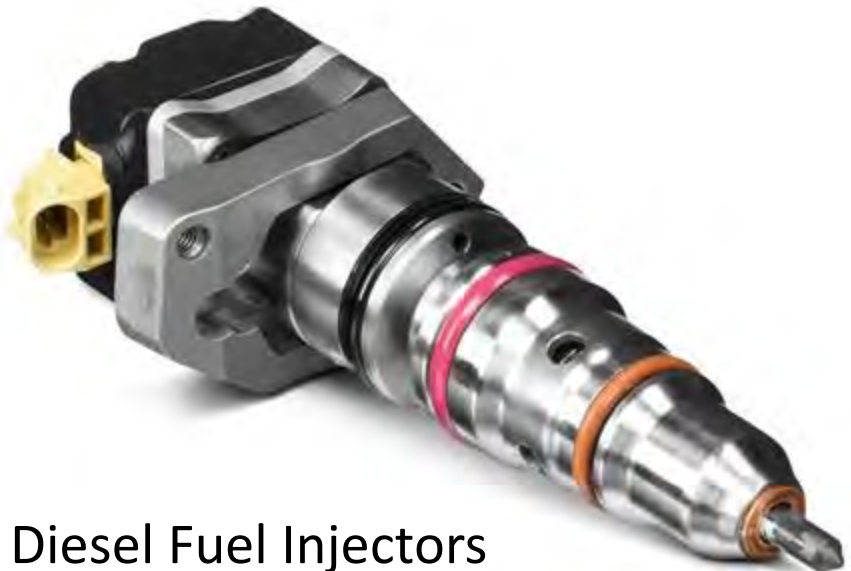
Premium Diesel Fuel Injectors

$10.00 EACH UNIT REBATED ON YOUR MONTHLY REWARD CARD