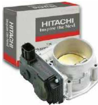
Electronic Throttle Bodies